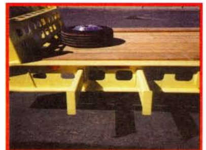
Optional sliding outriggers