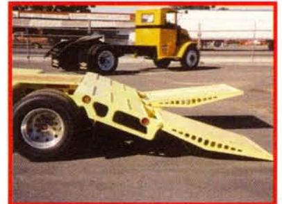
Optional air lift ramps