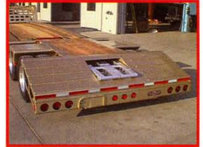
Optional in-deck ramp storage