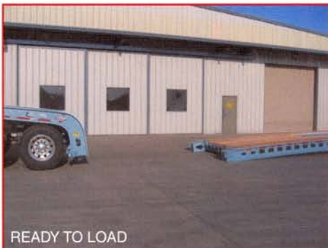
READY TO LOAD