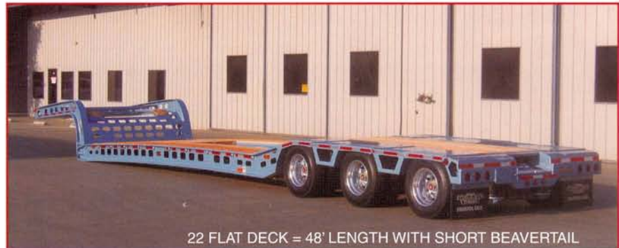
22 FLAT DECK = 48’ LENGTH WITH SHORT BEAVERTAIL