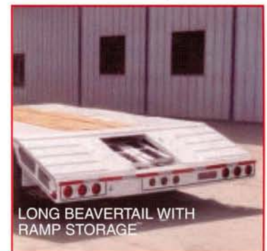
LONG BEAVERTAIL WITH RAMP STORAGE