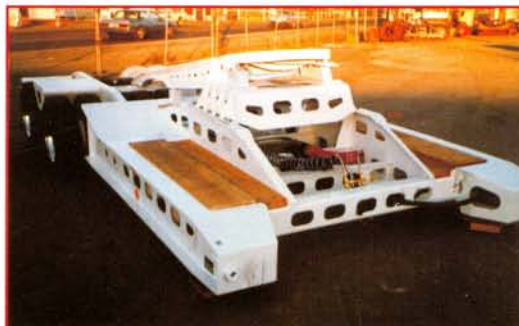
Expando Jeep: Gooseneck removed for use with trailer for 5- axle service.