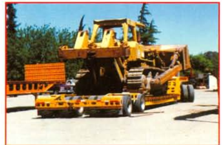
Rear loading demonstrated on “Professional” Model