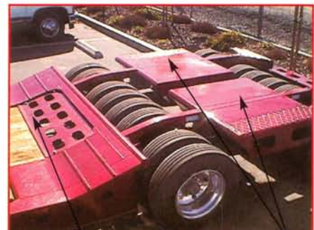
Optional "Ram Cover"