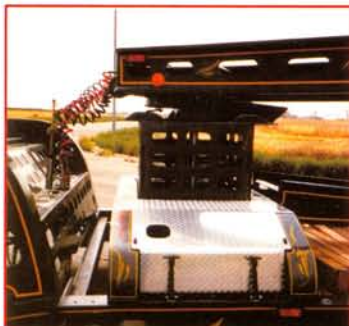
Optional Hydraulic or Air Lift on Jeep