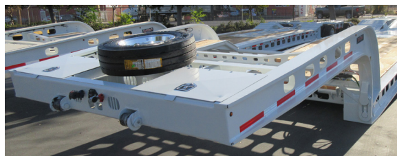
Lockable Tool Boxes & Spare Tire w/ Mount