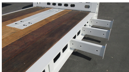
Sliding Outriggers & Paver Ramps