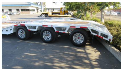
Wheel Covers & Extended Tail