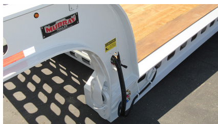
Outside Lines for Robolinks