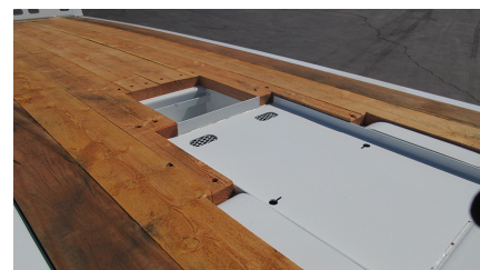
Deck Pan & Chain Box